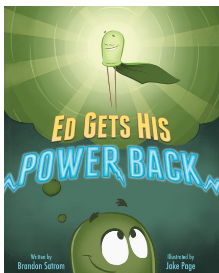
(1) Hardcover book

HERE'S WHAT'S INCLUDED! Kit replacement cost - $45 7 DAY LOAN and $1.00/day overdue fee